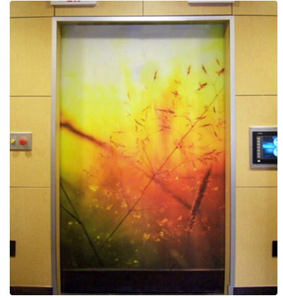
Photo and art files are available from a large selection of online providers such as iStock by Getty Images . Contact your Veritas sales representative for artwork requirements.

Veritas can utilize client-supplied, high-resolution art to produce acrylic panels that are attached directly to the door surface. Panels are provided for both sides of the door, and images may be the same for both sides, or different, depending upon your preference.